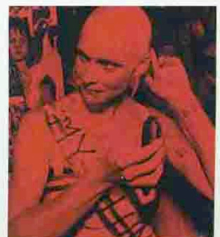
The "Myth" of California

announces she will join the Unitarian Universalist Association, which permits gay clergy. 26: Pope John Paul II gets a preview of reactions to his impending September visit when a rally for feminist and gay rights at the Vatican Embassy ends in a dozen misdemeanor arrests, including that of former NOW president Eleanor Smeal. 28: Philippine President Cory Aquino's troops quell a rebellion by mutinous Philippine soldiers. Fifty-three people are killed and hundreds are